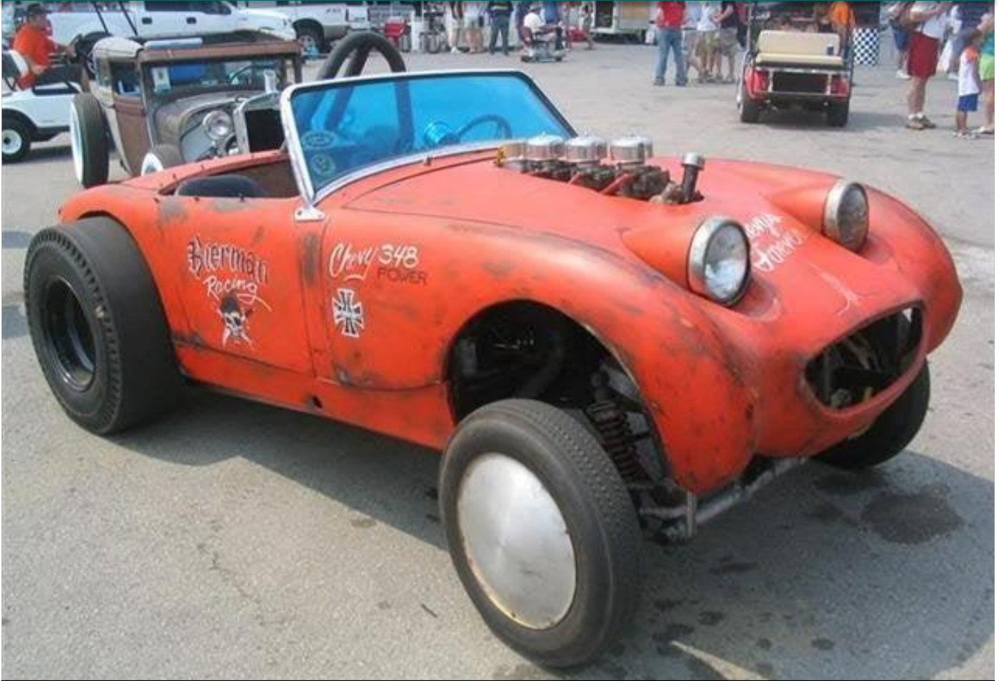
This probably doesn't deserve a caption, much less an explanation.