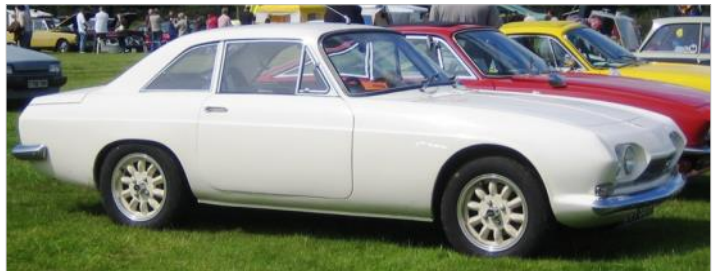
Above, SE4; below, SE5A

Now Reliant needed a sporting follow up so we have the first is the one that you probably know, the Scimitar. The most well-known Scimitar ran from 1964-1986 in either a coupe, shooting brake, or cabriolet form and multiple upgraded generations. But they always had a fiberglass