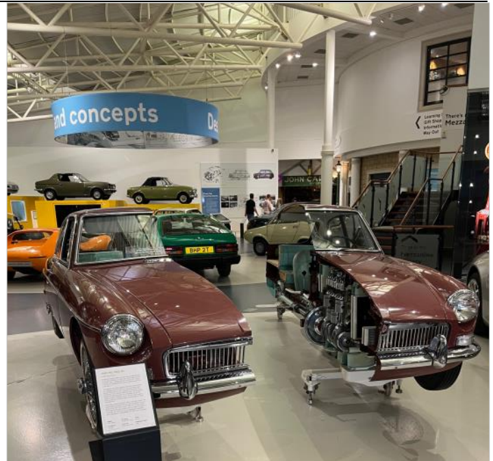
Above, a cutaway MGB GT, and below, a true “go anywhere” Land Rover, both at the British Motoring Museum

The other building holds a tight-spaced collection of cars and a full restoration shop with a