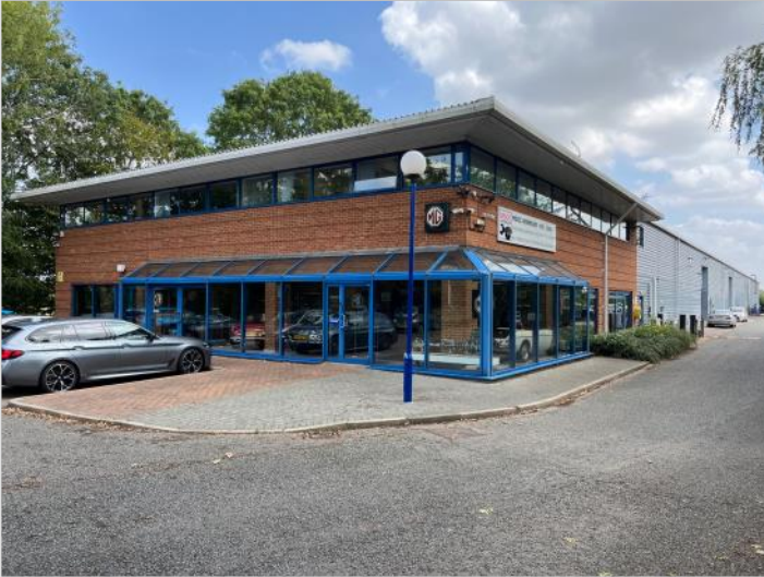
Above, the MGOC headquarters; below, the MGOC cutaway.

RAF v-bombers and now the Jaguar-Rover Centre hosting the principal research and development, engineering center, a large test track, and a proving ground. Also nearby is the Aston-Martin Centre.