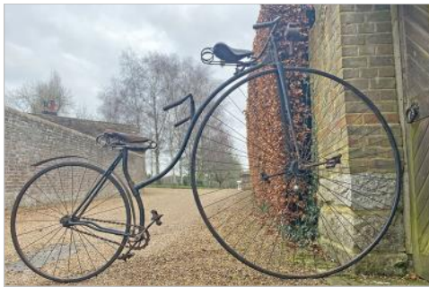
Replica of a ca. 1890s Rover Tandem