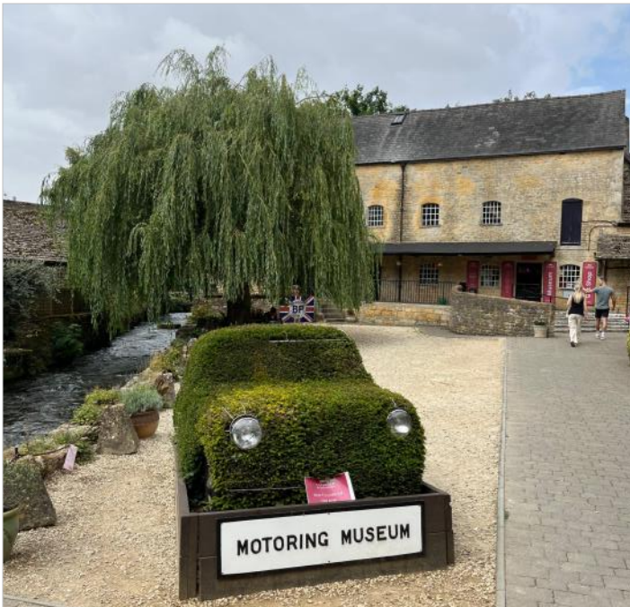
Auto topiary at the Cotswold Motoring Museum

Lynn and I arrived in Southampton and rented a car and drove to the Cotswold region, north-west of London, where we stayed at our base in Chipping Campden. Nearby in a town called Burton-on-the-water was a museum called the Cotswold Motoring Museum, holding a private collection of over 40 vehicles including cars, motorcycles, caravans, displays, and memorabilia, mostly from the 20th century.