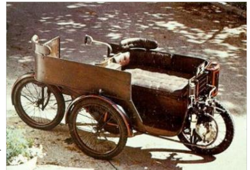
The first Sunbea