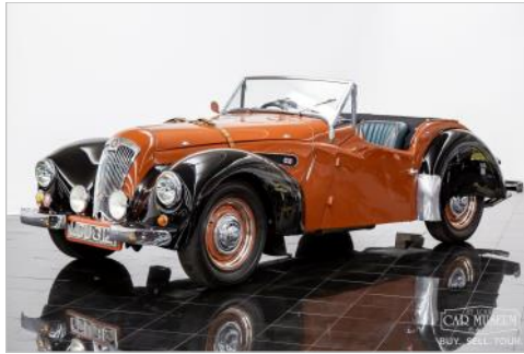
1950 Lea Francis 2.5 Sports Roadster