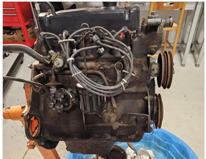
The partially-cleaned engine.