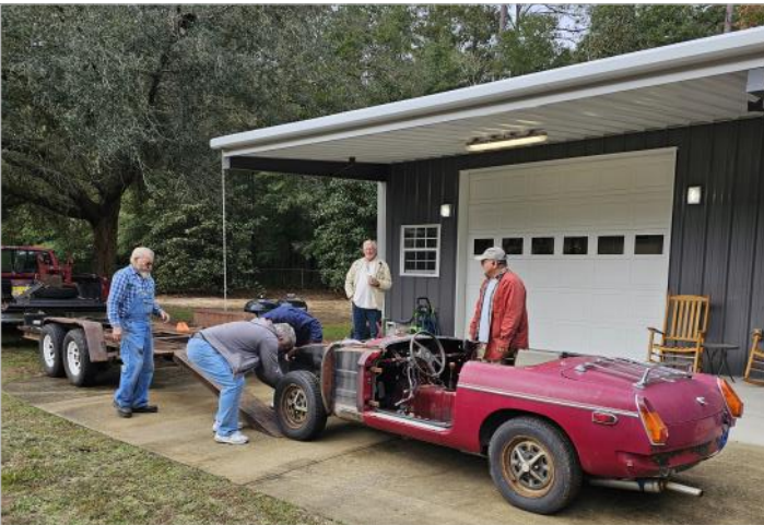
Top, the "victim" arrives; bottom, plenty of help under the car.