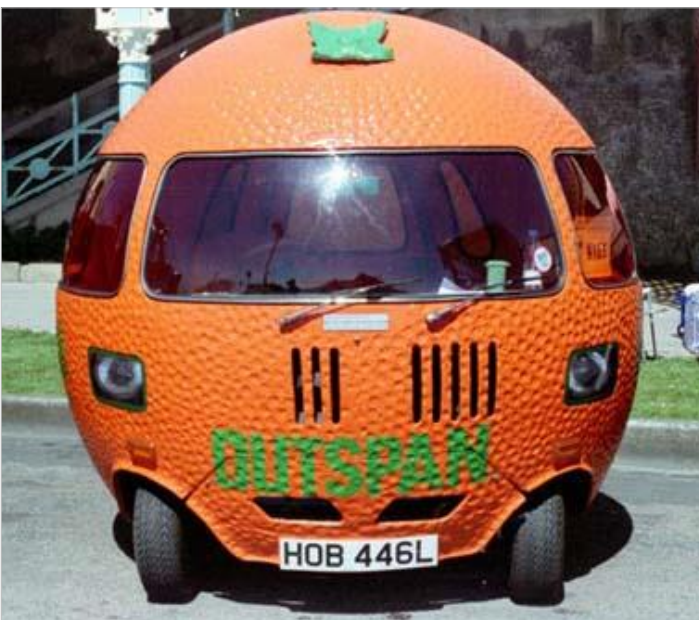
Outspan Mini

The promotional brainchild of the Capespan firm of South Africa, the Outspan Mini was a fiberglass representation of an orange placed on a shortened Mini platform. Outspan ordered five of the potentially roly-poly little cars for PR