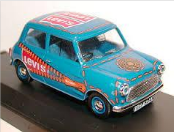
Levis Mini — does the original still exist?

While not as flamboyant as the first two cars here, the Levis Mini was done up in denim blue