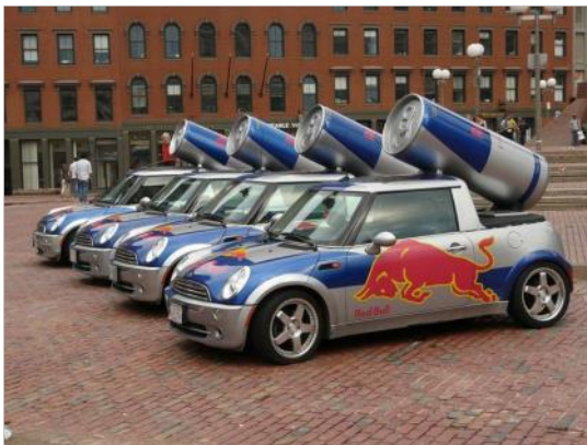
Red Bull MINIs

Of course the modern MINI is as much a canvas for today's American marketers with versions running