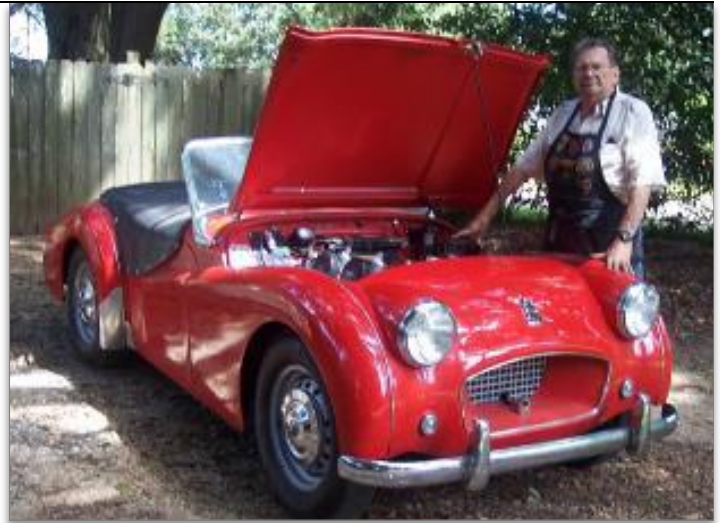
All photos courtesy Pierre Fontana

The Freon used was very efficient but bad for the for the environment, so in time it was replaced by a better one we use now, R-134a. It is reasonably priced and can be purchased anywhere; I've found Walmart to be the cheapest. You can still purchase the old Freon, R-12, but it is not manufactured anymore so you will have to pay dearly. [You will also pay about four times the price of R-134a for the newest refrigerant, R-1234yf, which has been used in some cars since 2013 and